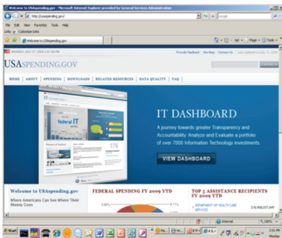
IT Dashboard – Visualizing IT Spending

From listening tours to webcasts to town halls, the White House and federal agencies are opening up the way they work. It’s almost hard to believe that the first blog in the federal government only began in 2008!