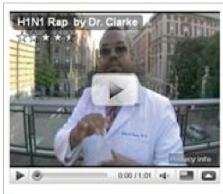
The H1N1 Rap by Dr. Clarke won the 2009 Flu Prevention PSA Contest