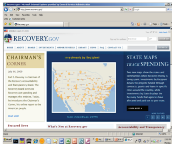
Recovery.gov – Tracking Stimulus Spending