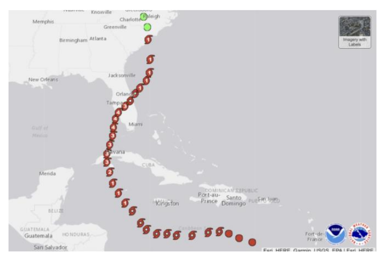
Figure 3: Path of Hurricane Ian. September 2022

In late September 2022, Hurricane Ian, a strong Category 4 storm, struck Florida and South Carolina. The hurricane damaged countless properties, destroyed critical infrastructure, and required resource deployment to restore many of the government's identified Emergency Support Functions (ESF). Ultimately, every state in Region IV would experience the effects of lan. Early in the incident, the decision was made to activate ESF #2 – Communications to prepare for the anticipated loss of critical communications infrastructure and services. Ms. Montanari moderated a panel discussion with local, state, and federal specialists who served on the ground in Florida to discuss how the restoration of emergency communications services and networks after Hurricane Ian was approached and executed.